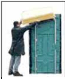
Holding Tank 65 Gallon Capacity Porta John® E-mail: info@toilets.com