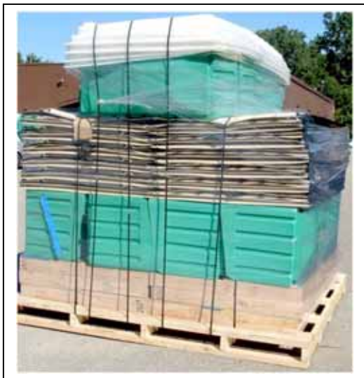
12 Complete Model FPT 300 Ready to Ship